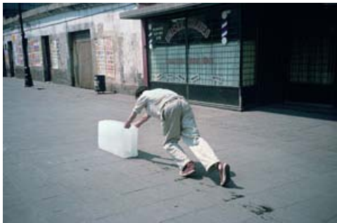
Paradox of Praxis , Francis Alÿs, still from Paradox of Praxis 1 , 1997, video, 5'.