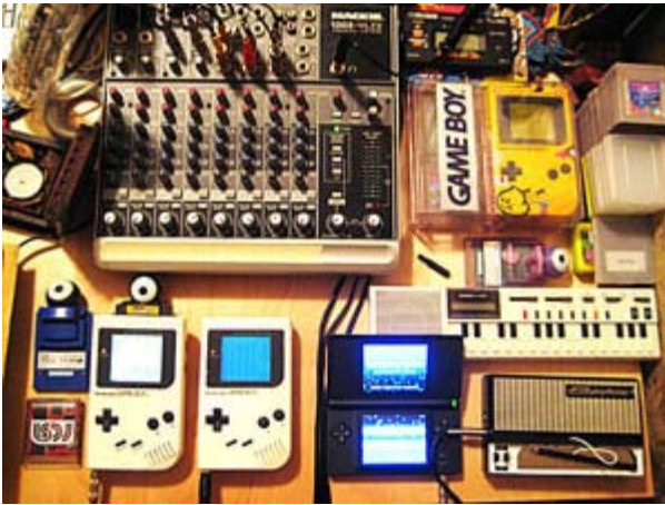
Some of the electronic devices used to create Chiptunes, by the Attic Bits.

rendered audiovisual demonstrations of coding, musical, and artistic prowess. Demos are meant to be technically as well as visually impressive.